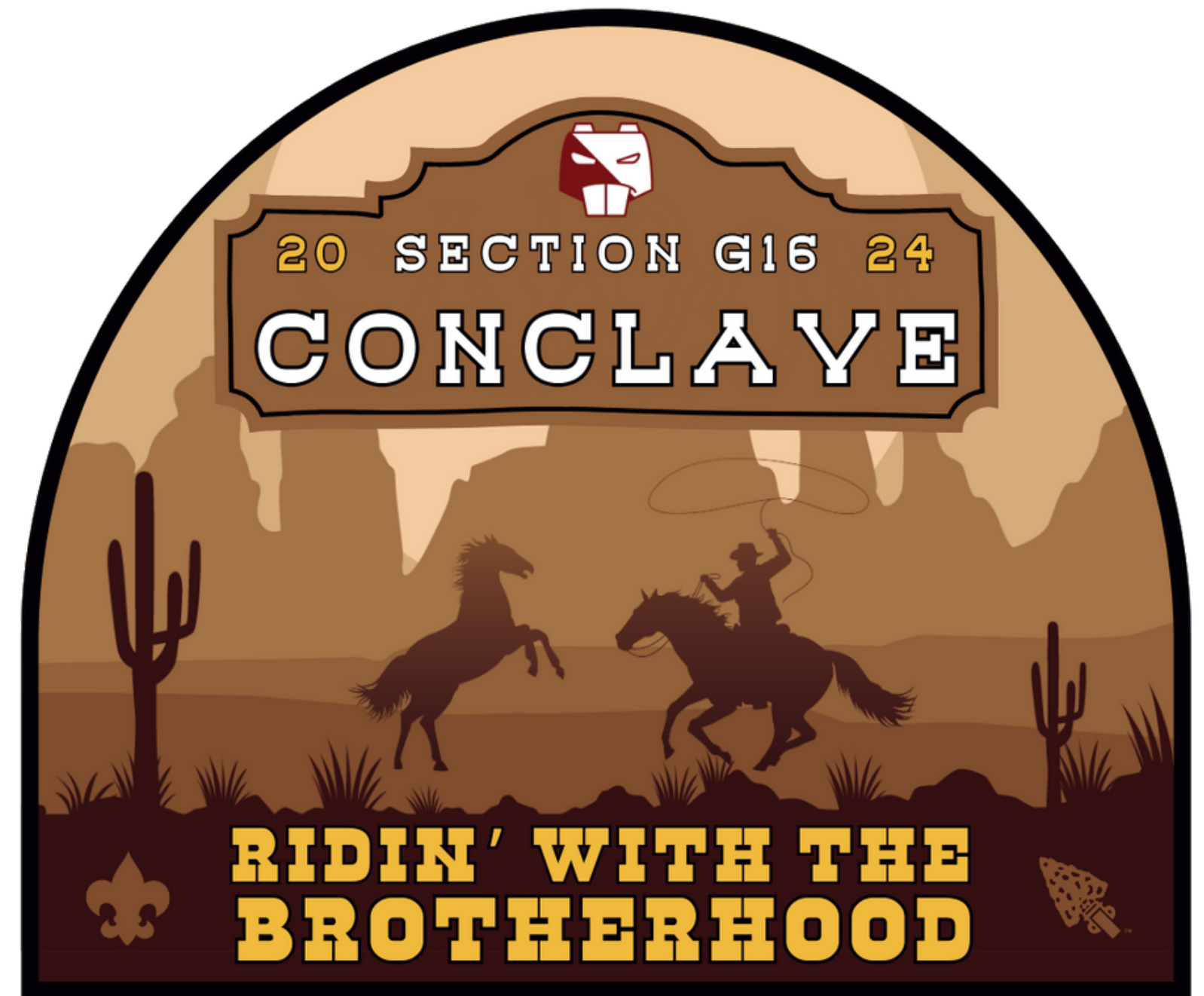
2024 Conclave Logo

"Courage is being scared to death and saddling up anyway!" – John Wayne